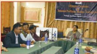
Speakers at the Orientation Programme of Trainers of DPIT course