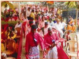
Students performing cultural programme (Study Centre: Shanti Devi Vidyaniketan)