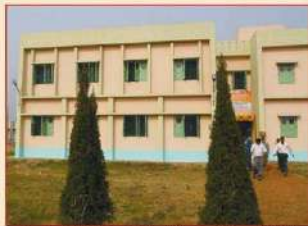
Vocational building at Kalyani Regional Centre, NSOU