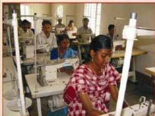
Students of Tailoring & Dress Designing – in the workshop (Study Centre: GHFTS, South 24 Parganas)