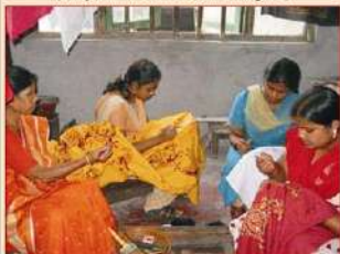
Students of Needle work- engaged in their class work (Study Centre: Nari Siksha Samiti, Kolkata)