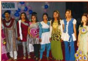
NSOU students at the Apparel Show (Study Centre: SSSA, Hirbhum)