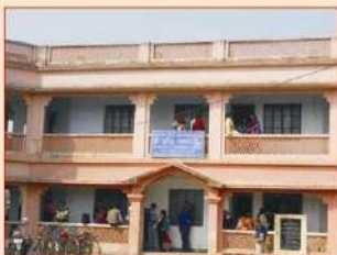
Vocational Centre at SSDA, Prantik, Birbhum