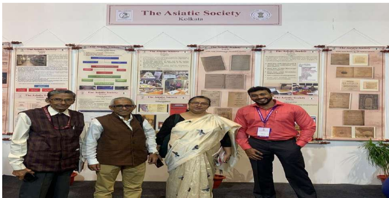
Photograph-5 Stall of Asiatic Society Kolkata

The event also facilitated panel discussions among organisers of about eight literature festivals, publishing houses, young authors, representatives etc.