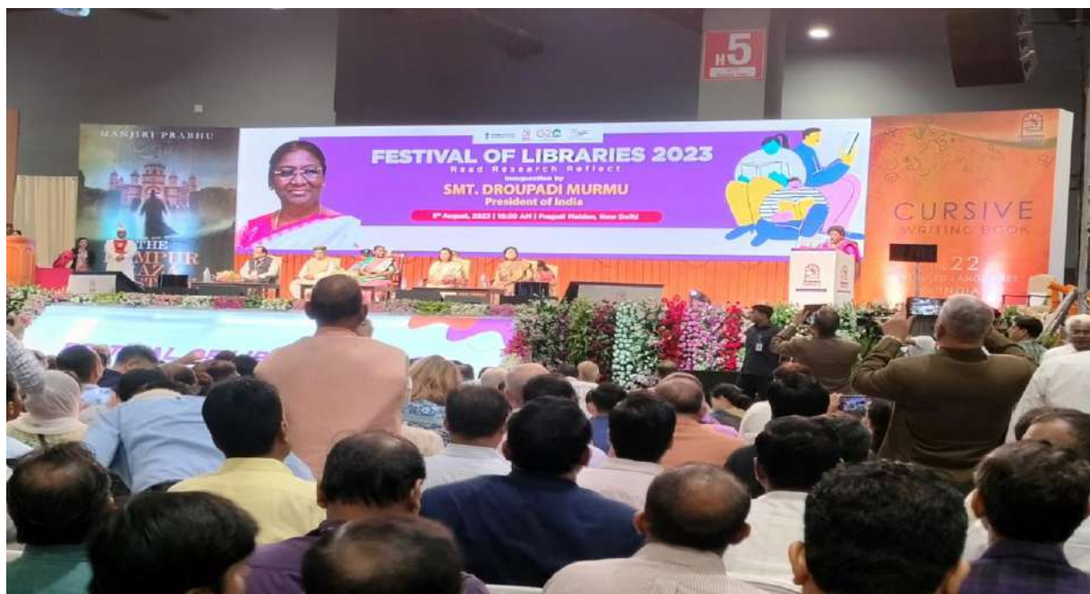
Photograph-3 Smt Mugdha Sinha, Secretary, Ministry of Culture

On the inaugural occasion, Secretary Ministry of Culture, Shri Govind Mohan said that there is a deep connect between Libraries and Museums and there is also a need to have an appropriate mix of physical and digital libraries, and both these issues will be discussed at length during the Festival. Libraries are essential for emotional and mental development and therefore, it is important to revive reading habits among the people. He added that The Festival of Libraries at Delhi will kick off with a series of exciting launch events, exhibitions, and panel discussions. It will also introduce a special ranking system for libraries across India, encouraging healthy competition and progress in the library ecosystem.