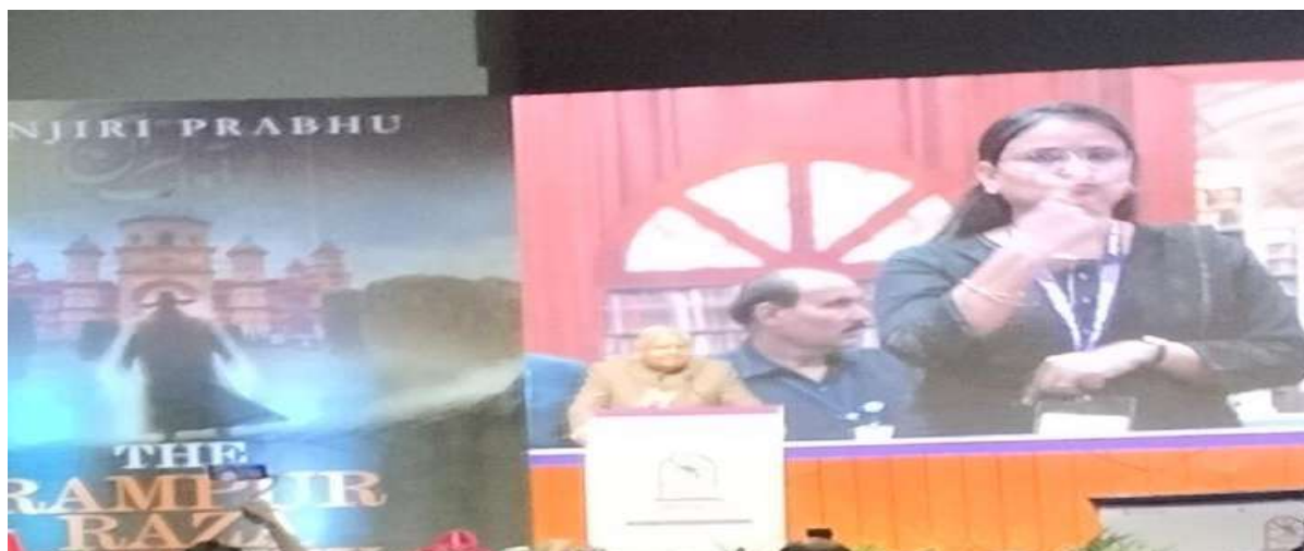
Photograph-6 Sri Jagdeep Dhankhar, Vice President of India giving his Valedictory Speech

At the valedictory session was chaired by hon'ble Vice President Sri Jagdeep Dhankhar. He released the first volume of the Directory of Libraries and 'Biblio-on-Demand' scheme as part of the 'One Nation, One Subscription' policy.