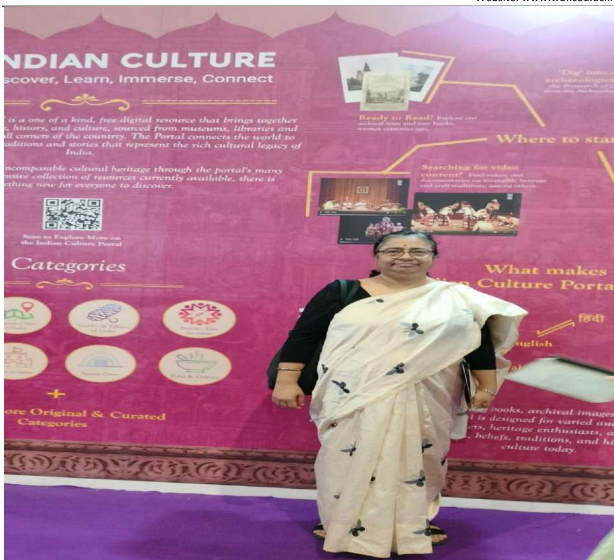
Photograph-4 Stall of Ministry of Culture

The digitization of archives, particularly private collections was discussed, explored a remarkable exhibition featuring rare archival collections and illuminated manuscripts.