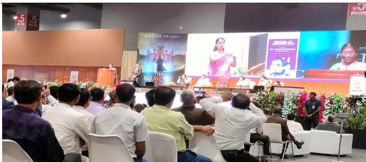
Photograph-1 President of India Smt. Droupadi Murmu deliberating her speech in the inaugural programme of “Festival of Libraries”

Remarkable launches were happened by The President of India such as a crowd-sourced Directory of Libraries and the signing of a Tripartite MOU between three prominent libraries: Khuda Baksh Oriental Public Library, Patna; Rampur Raza Library, Rampur; and Maulana Abul Kalam Azad Arabic Persian Research Institute, Tonk, for long term collaborative events, commencement of celebration of 250 years of the Rampur Raza library, Launch of the Sassy Library Series with the plot based on Rampur Raza Library, and the release of a set of Cursive Writing Books in the 22 vernacular languages.