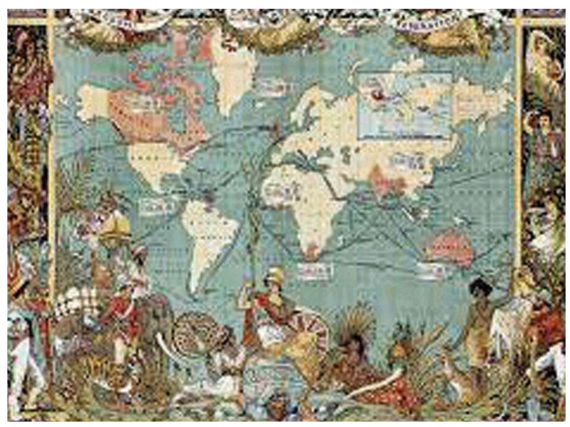
Imperial Federation, map of the world showing the extent of the British Empire in 1886. Author: Colomb, J. C. R. Pub. MacClure & Co., 1886. The map above will give you a pictorial idea of the extent of the British empire, hence justify the popular Victorian coinage that the sun never sets in the colonial realms of the Empire, wherever one travels across the world. We can therefore sum up the following points: