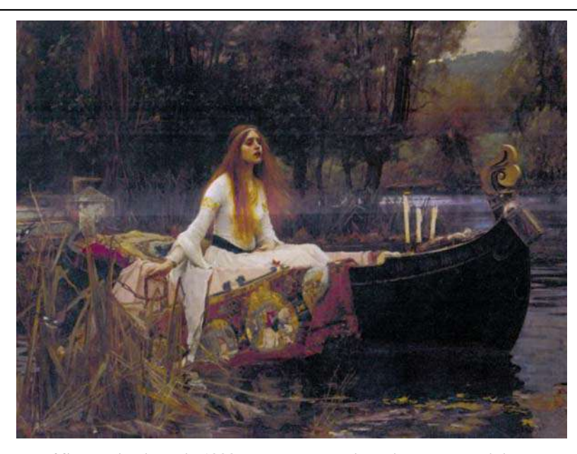
'The Lady of Shallott' painted in 1888 by Pre-Raphaelite painter John William Waterhouse. It represents a scene from Alfred, Lord Tennyson's poem 'The Lady of Shallott'