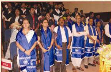
Ph.D. sardarses at the 8th Convocation of NSOU on 13th May 2010