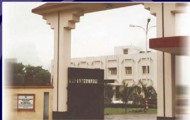
Netaji Subhas Open University — Kalyani Campus

Price: Rs. 100/- (US$ 10) (inclusive of postage)