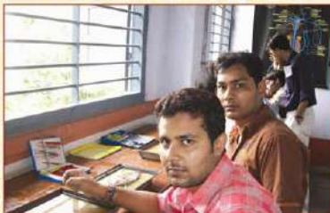
Students of the School of Science at the Laboratory Counselling cum Evaluation session.