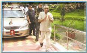
His Excellency the Governor of West Bengal and Chancellor, NSOU, Sri M. K. Narayanan arrives at the 8th Convocation held on 13th May, 2010.