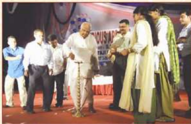
▶ Sri Somnath Chhottopadhyay, Former Speaker of the Lok Sabha, inaugurates the Apparel Show organised by students of SSDA Study Centre at Gitanjali Auditorium, Bolpur