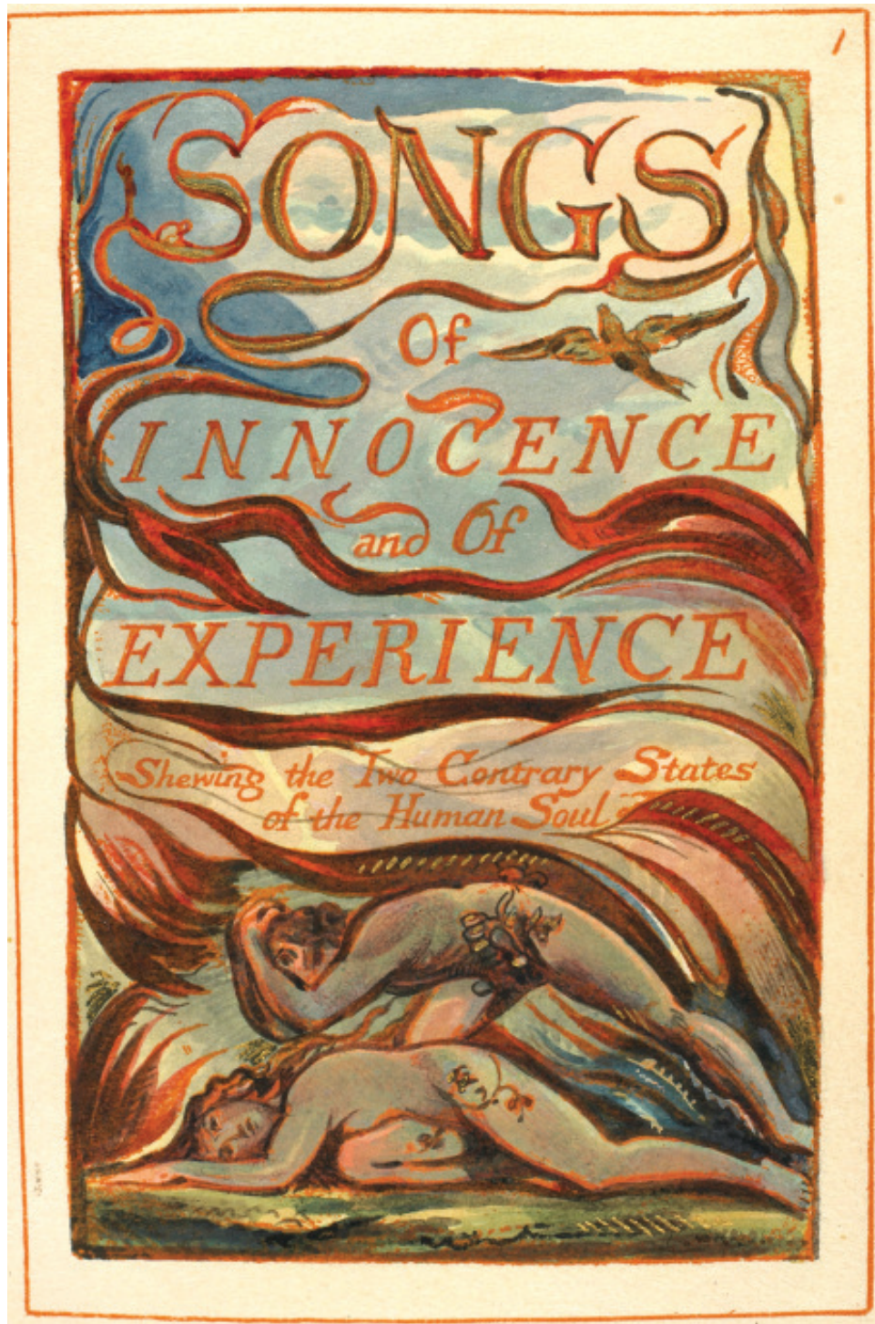
Plate - 1