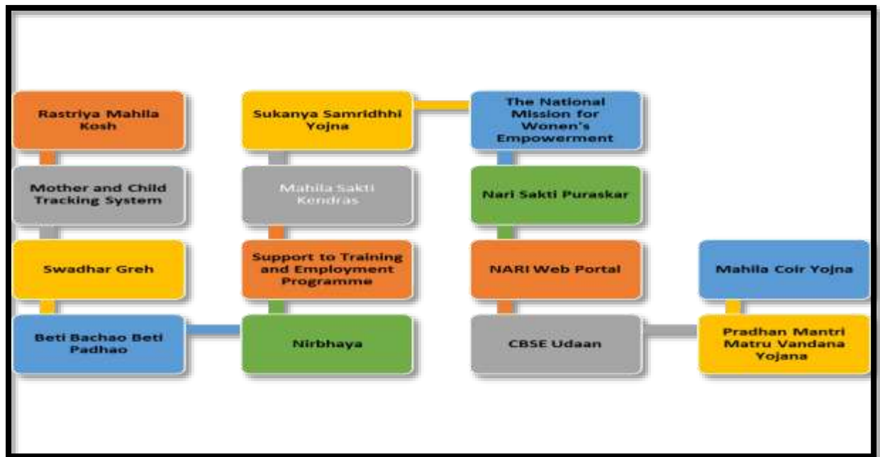
Fig.2: Central Government Based Initiatives

There are numerous additional initiatives and programmes run by the Indian government at the national level that work to remove gender disparities and elevate women in society. The aforementioned programmes not only address gender inequality, but they also make it obvious how to rid society of vices while preserving the rights and safety of women.