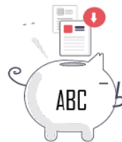
Transfer of Credits