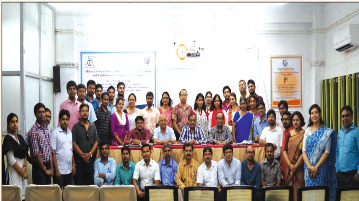
Participants, Director, Faculties of SoE, NSOU at Sensitization program held at the Kalyani Campus, SoE, NSOU. During 21 st - 23 rd June, 2018.