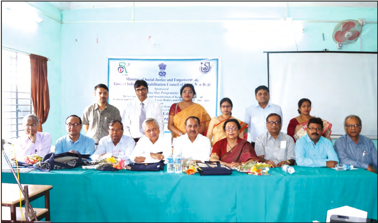
Dignitaries from RCI, Resource Person, Faculties of SoE, NSOU and others and at the inaugural session of RCI Sensitization program held at Siliguri, West Bengal During 16 th -18 th Febuary,2017