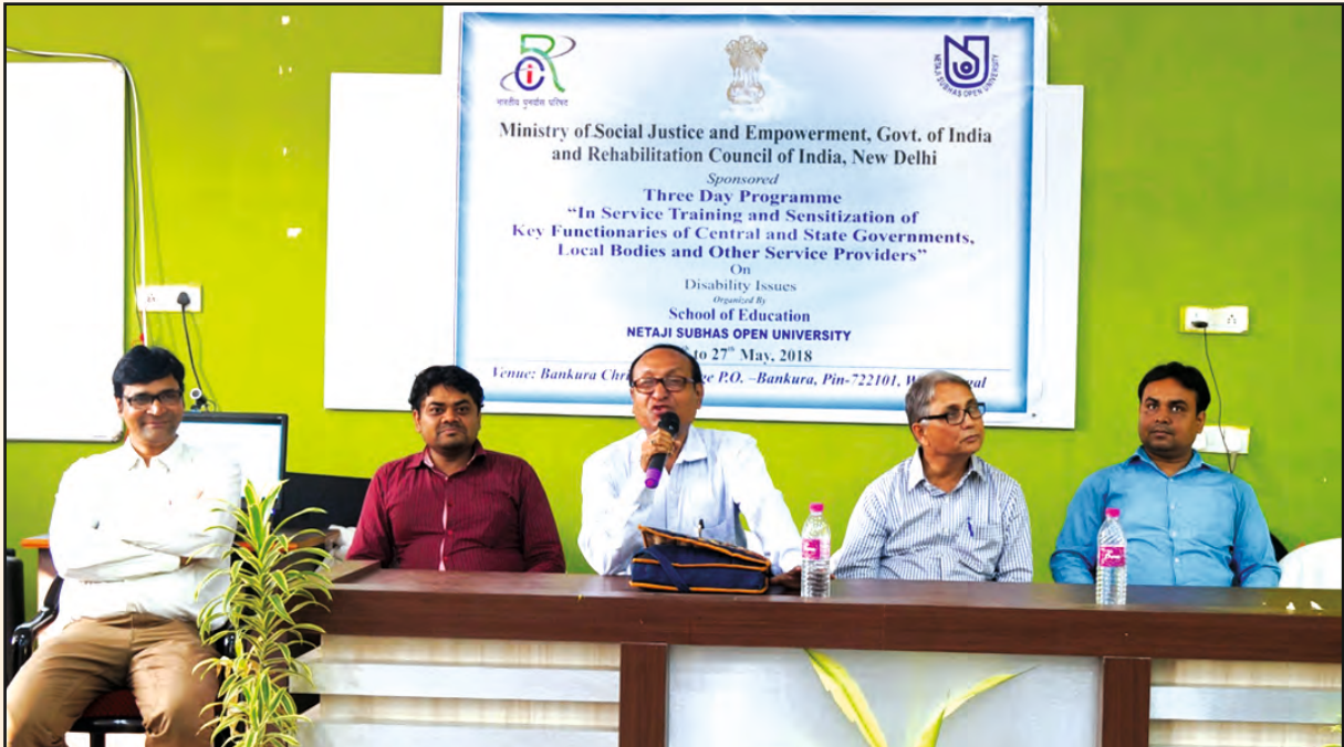
Valedictory program relating to RCI Sensitization program is in session.Held at Bankura Christian College, Bankura West Bengal during 25 th to 27 th May, 2018