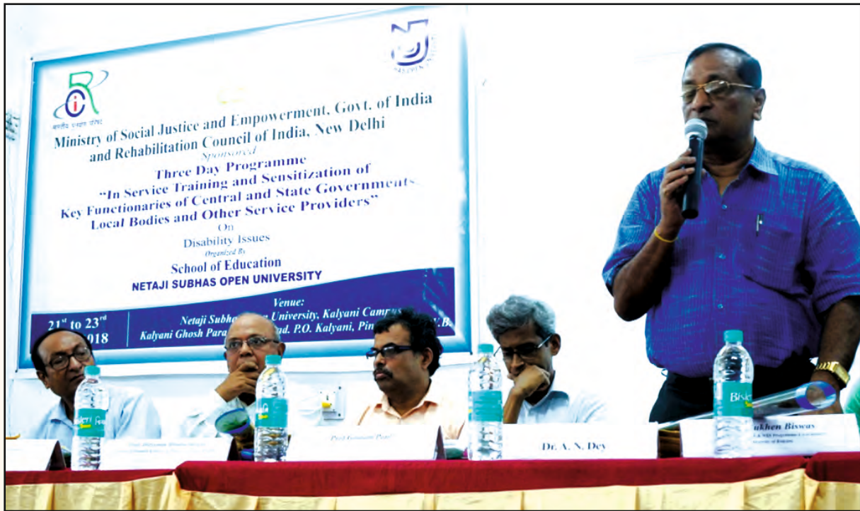
Director, SoE, NSOU addressing at the inaugural session of RCI Sanitization program held at Kalyani Campus, NSOU. Dignitaries and other Faculties of SoE, NSOU also present at the dias