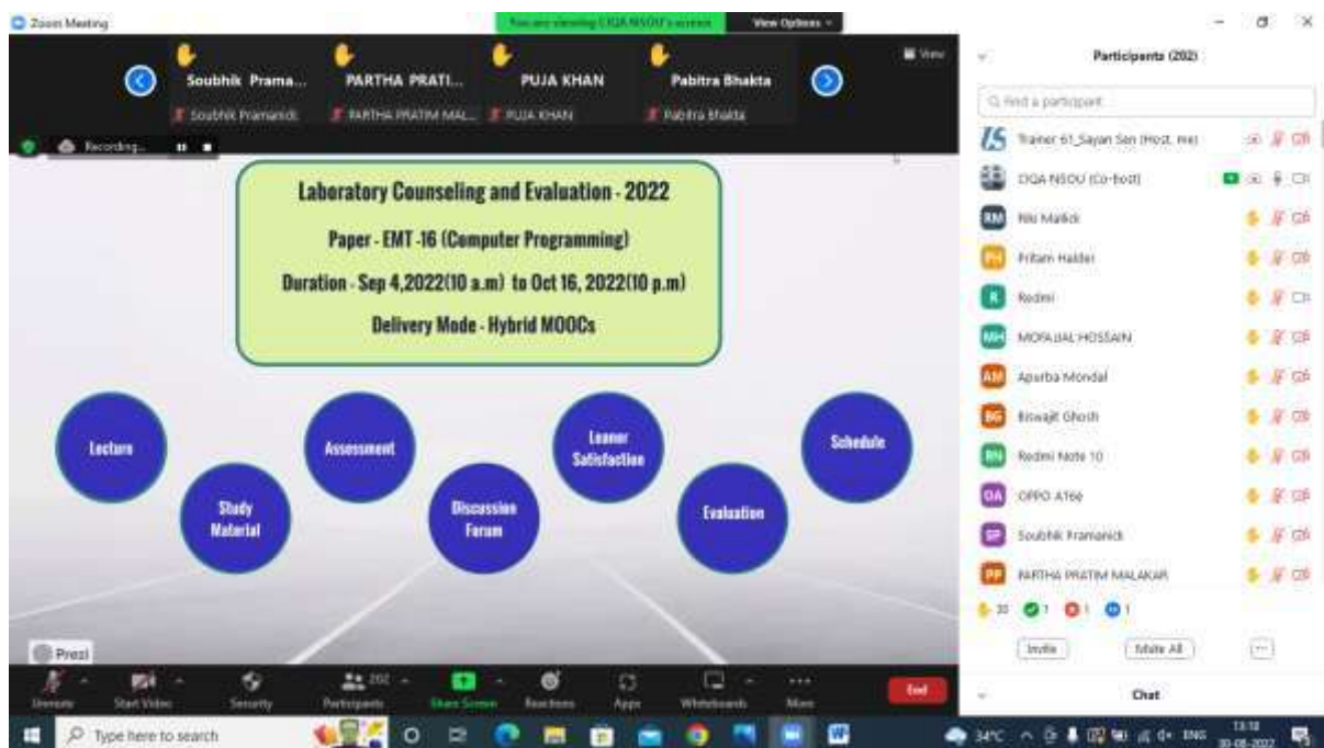
Figure 2: PPT presentation of Mr. Mrinal Nath

– 2022 through Power Point presentation.