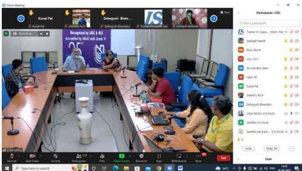
Figure 3: Hon'ble Vice-Chancellor delivering his presidential speech