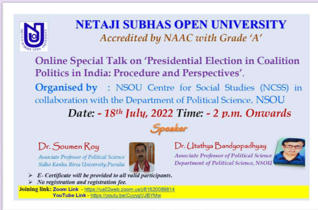
Poster of the Special Talk